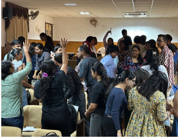
Participants engaging in an interactive activity