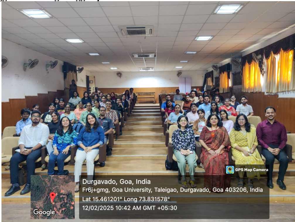
Group picture with the participants and the organizers of the workshop