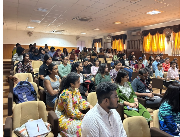
Participants attending the workshop