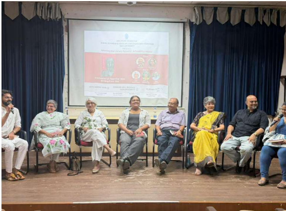
The Panel Discussion