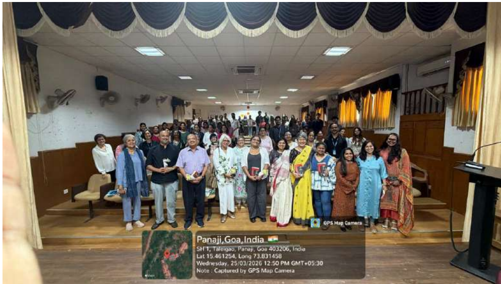
The Group picture