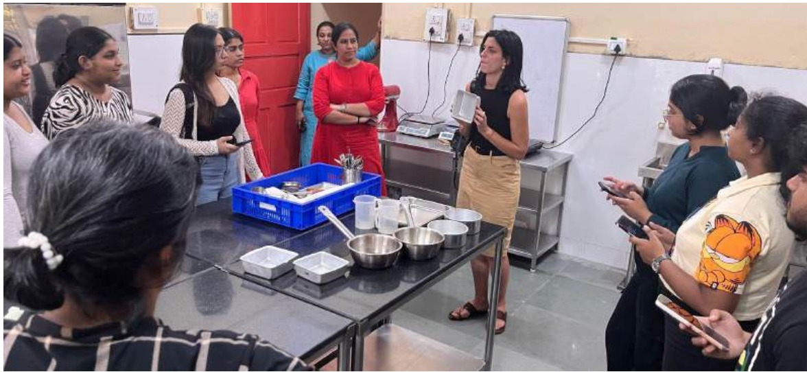
Students assisting in preparing the dishes