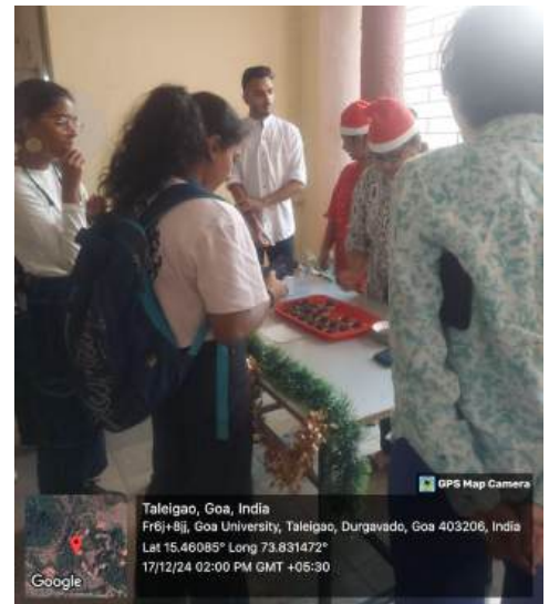
Quiz and activities based on Christmas celebrations in France and other Francophone countries, 17th December 2024 from 2pm to 4pm.