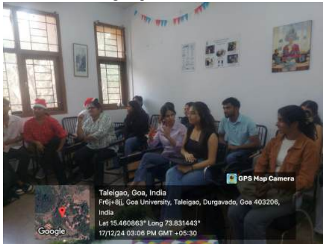
Students watching clips on Christmas