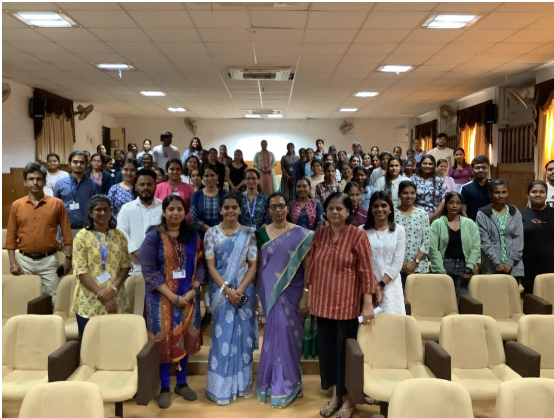
Group photo with the resource persons, participants and organizers.