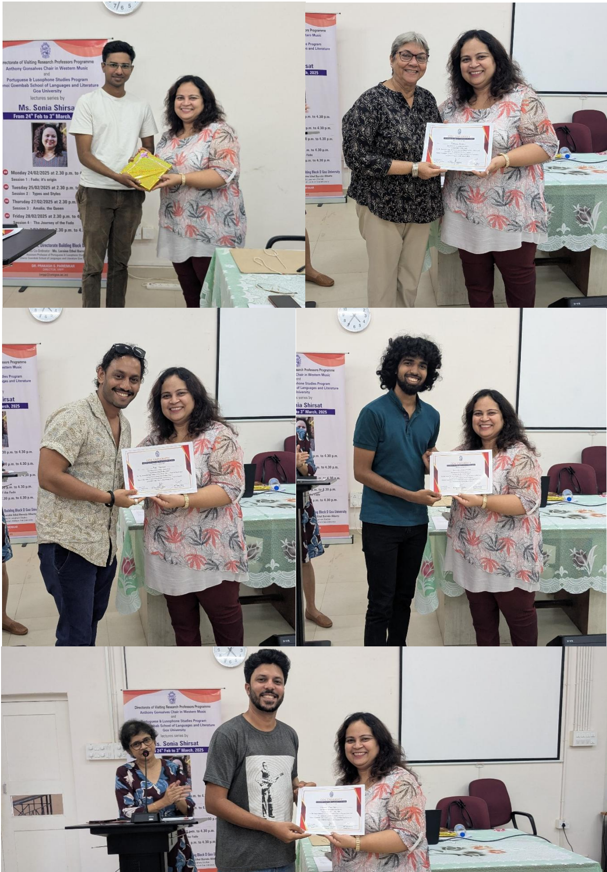
Distribution of Certificates to all the participants