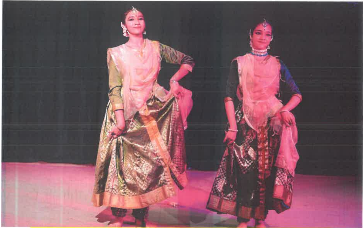
Dance performance by artists from Mahagami Arts Research Foundation