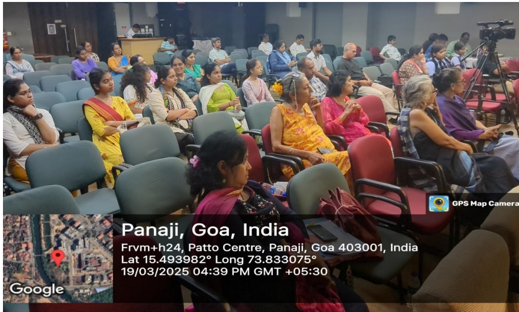
Participants enjoying the dance performances by the disciples of Guru Parwati Dutta