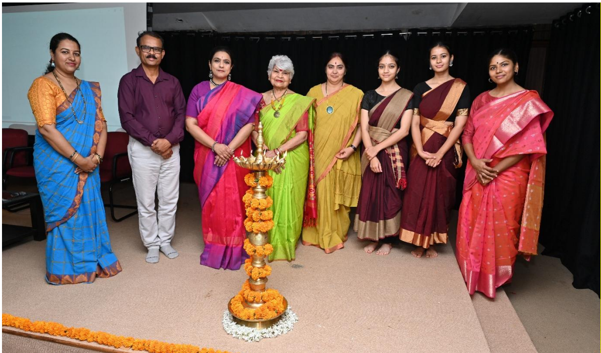
Group photo after Lamp Lighting ceremony