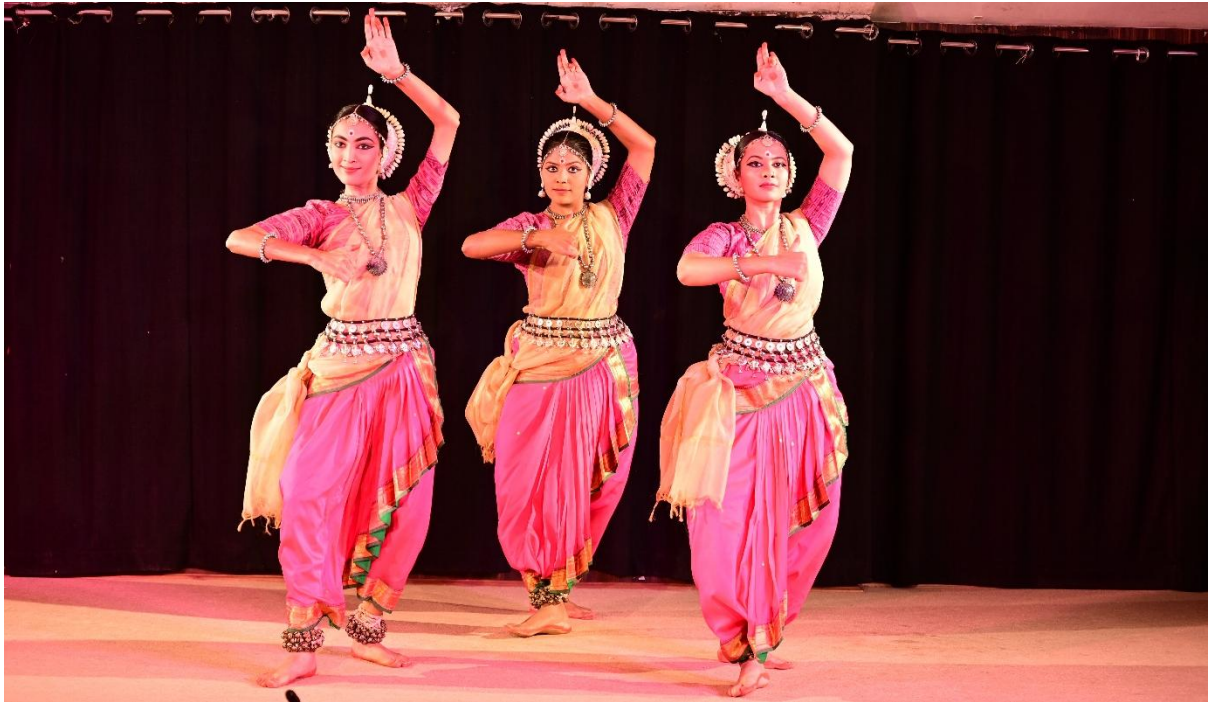
Dance performance by artists from Mahagami Arts Research Foundation