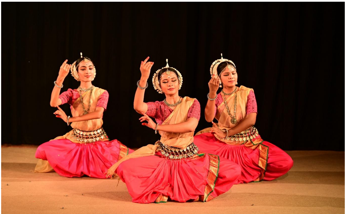
Dance performance by artists from Mahagami Arts Research Foundation