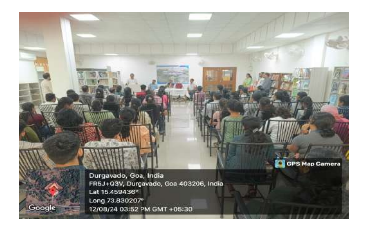
Prize distribution function