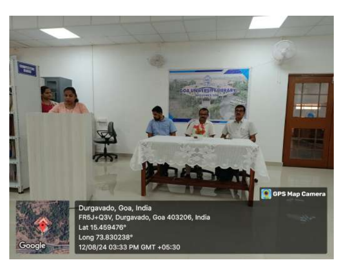
Introduction of Chief Guest