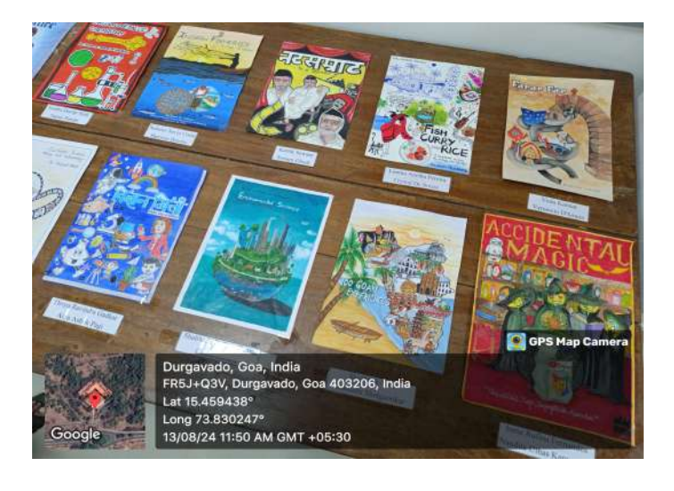
Book Cover Design by participants