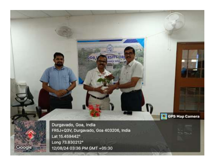
Welcome of Chief Guest