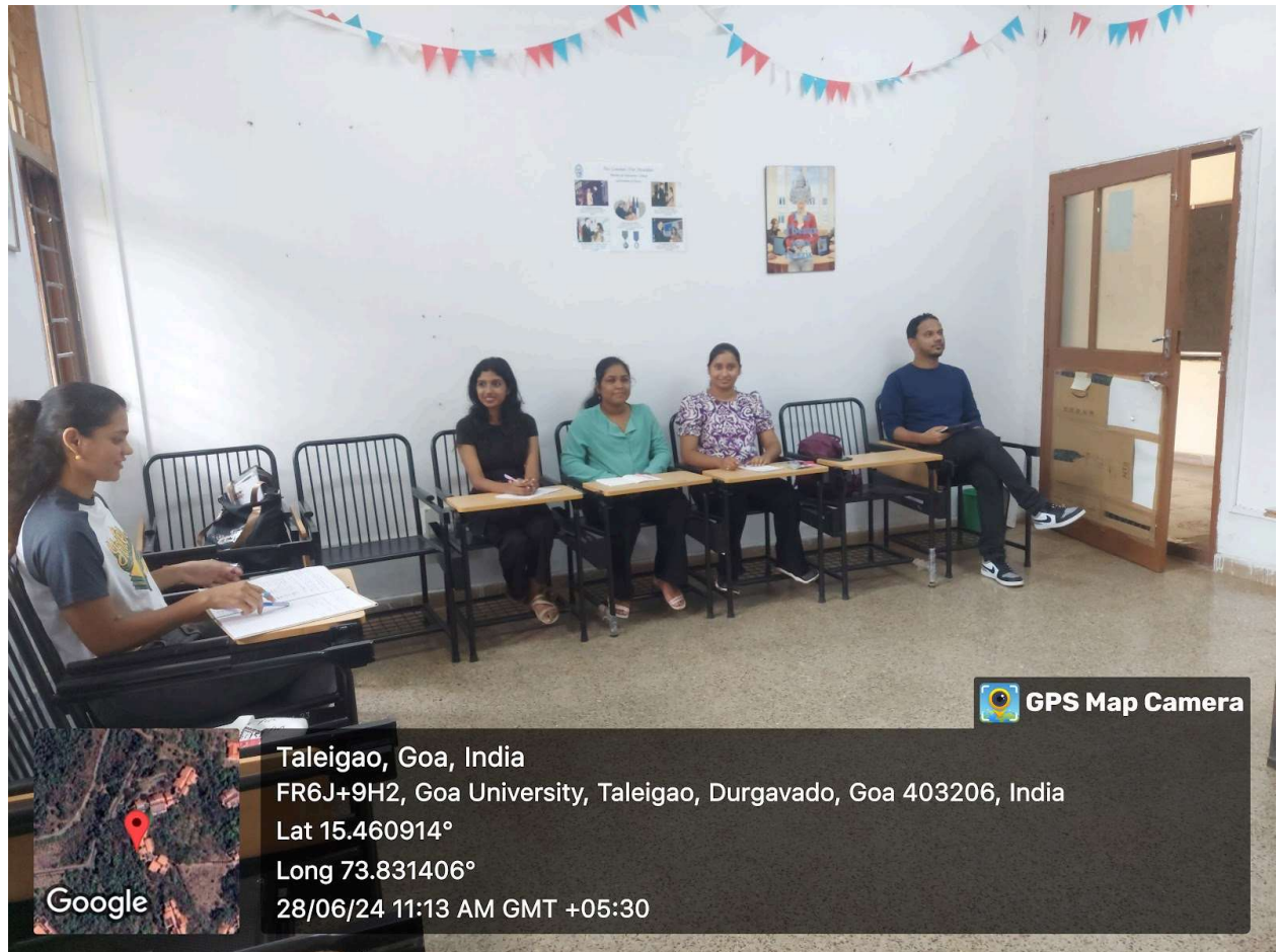
The students introducing themselves to the rest of their classmates.