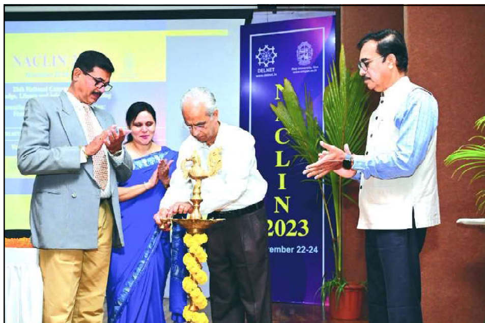
NACLIN 2023 Inauguration

The 26 th National Convention on Knowledge, Library and Information Networking–NACLIN 2023 on the theme “ Reinventing and Revitalising Libraries: From Striving to Thriving ” was organised by DELNET, New Delhi in collaboration with Goa University, Goa from November 22-24, 2023 at the Goa University, Goa. Nearly 250 delegates from different parts of India including Library experts, Librarians, LIS Professionals, Exhibitors and Product Demonstrators actively participated in the Conference.