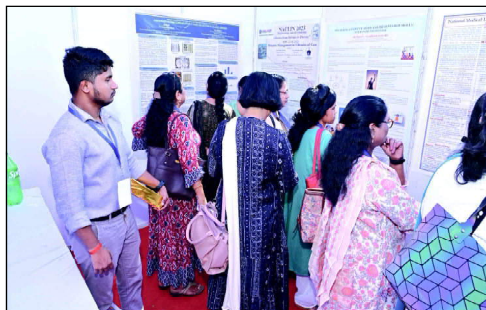
Delegates at Poster Presentations