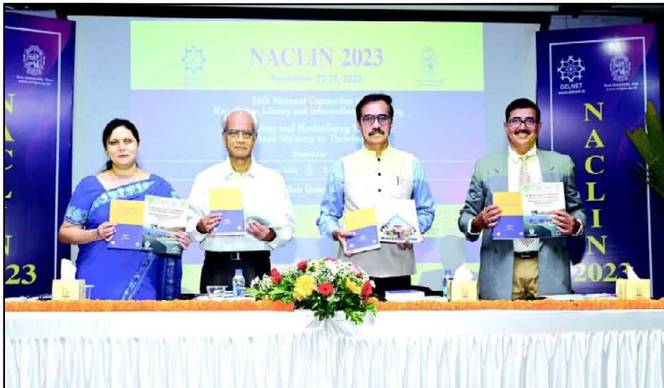
Release of NACLIN 2023 Publications

The participation of experts, as well as library and information science professionals will certainly lead to interactive discussions, sharing experiences and new learnings. The Kartavya Kaal till the year 2047 is a period to fulfil our vision of building a strong, inclusive and developed nation, reinforcing its position as a thought leader in the domains of wisdom and intellect.