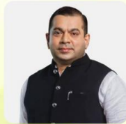
Chief Guest Shri. Rohan Khaunte Minister of Tourism of Goa