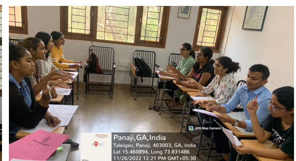
Students of MA French taking the pledge

aleigao, Goa, India R6J+GMG, Goa University, Tale Idia at 15.461297° ong 73.831765° 8/11/22 10:13 AM GMT +05:30