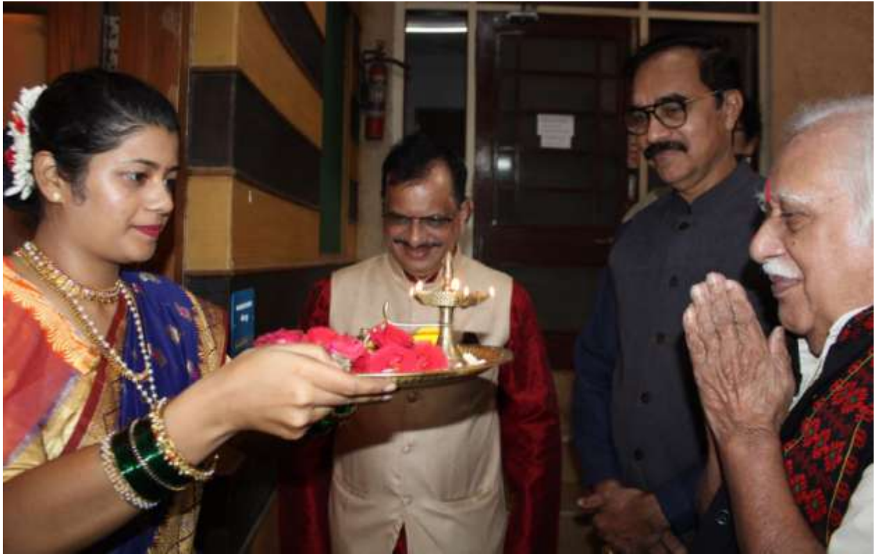
Welcoming dignitaries by waving Pancharati