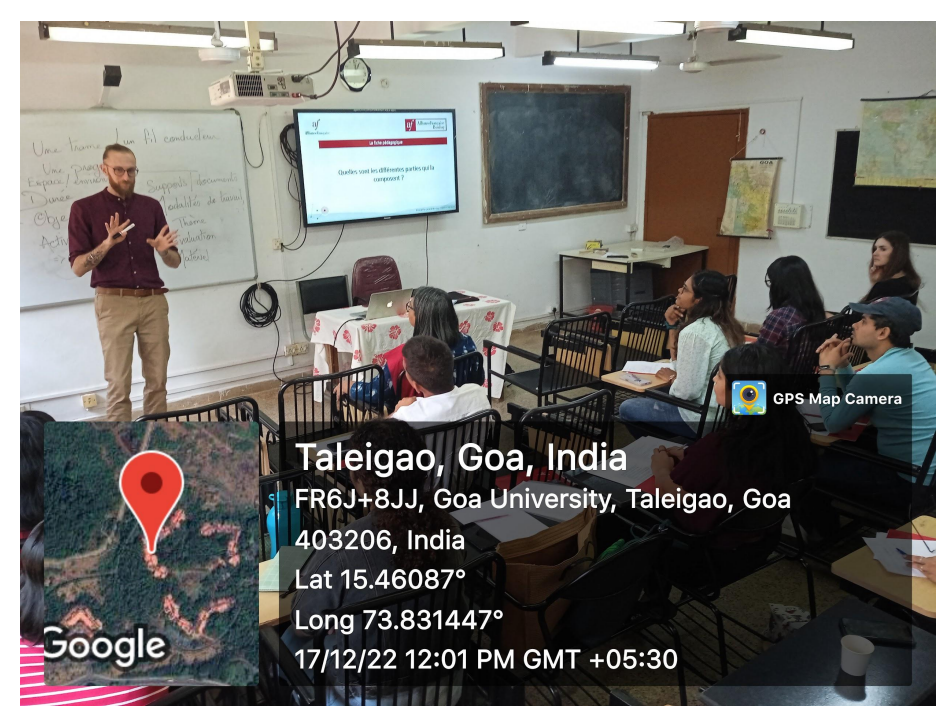
Photo 3: Resource person M. David Petitjean providing inputs on conceptualizing a pedagogical session.