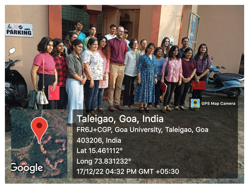
Photo 6: Participant Group photo at the end of the training workshop