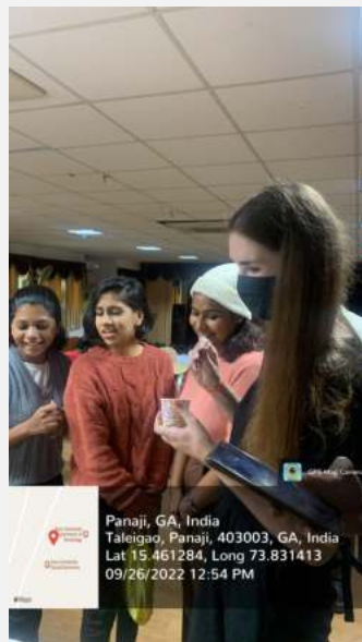
Photo 12: Faculty Tasting the dishes