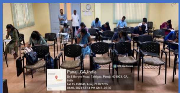
Panaji, GA, India Dr. E Borges Road, Taleigao, Panaji, 403003, GA, India Lat 15.458646, Long 73.827765 04/06/2023 12:14 PM GMT+05:30