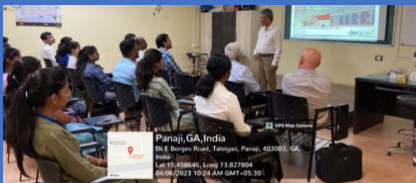
Panaji, GA, India Dr. E Borges Road, Taleigao, Panaji, 403003, GA, India Lat 15.458646, Long 73.827804 04/06/2023 10:24 AM GMT+05:30