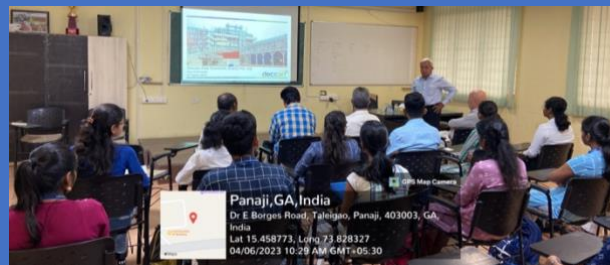
Panaji, GA, India Dr. E Borges Road, Taleigao, Panaji, 403003, GA, India Lat 15.458773, Long 73.828327 04/06/2023 10:29 AM GMT+05:30