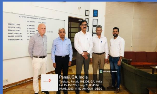
Panaji, GA, India Taleigao, Panaji, 403206, GA, India Lat 15.458705, Long 73.834534 04/06/2023 11:52 AM GMT+05:30