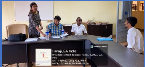
Panaji, GA, India Dr. E Borges Road, Taleigao, Panaji, 403003, GA, India Lat 15.458662, Long 73.827481 04/06/2023 02:44 PM GMT+05:30