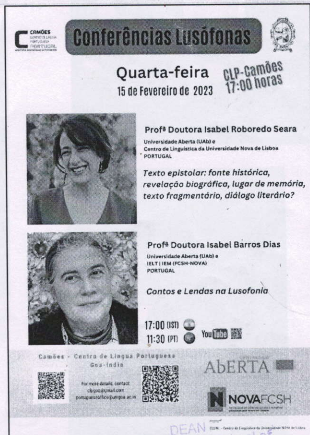
Copy of Flyer of the event