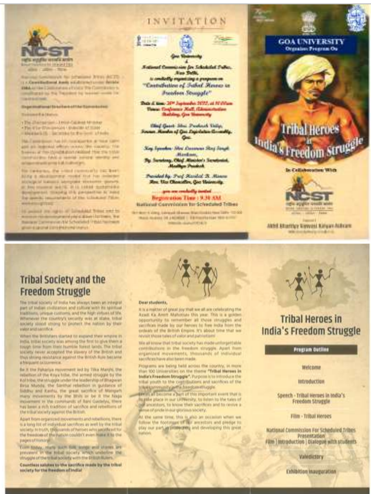
Copy of Flyer of the event