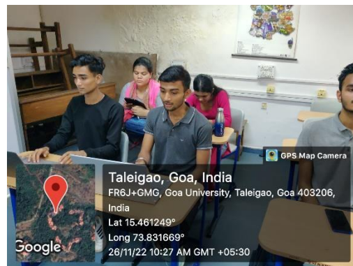
Students of B.A. French (Honours) attending the celebration of Constitution Day.