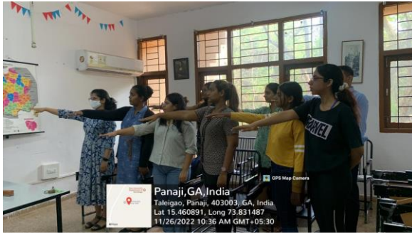
Students of MA French taking the pledge