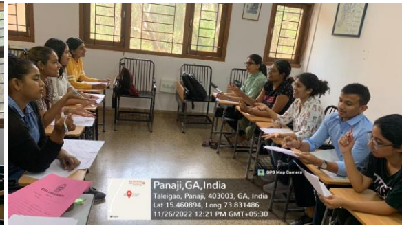
Class discussion by MA French students on constitutional values and the similarities between the Indian and the French Constitution

Link of the video recording of students of MA French taking the Pledge