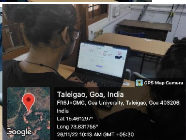
Students of B.A. French (Honours) reading the Preamble and taking online quiz.