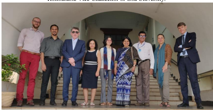
The delegates from the French Embassy in India visited the Goa University Library.