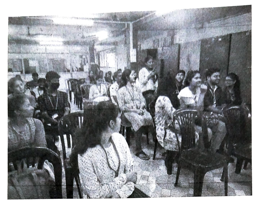
Photograph 1: A student participating in the discussion