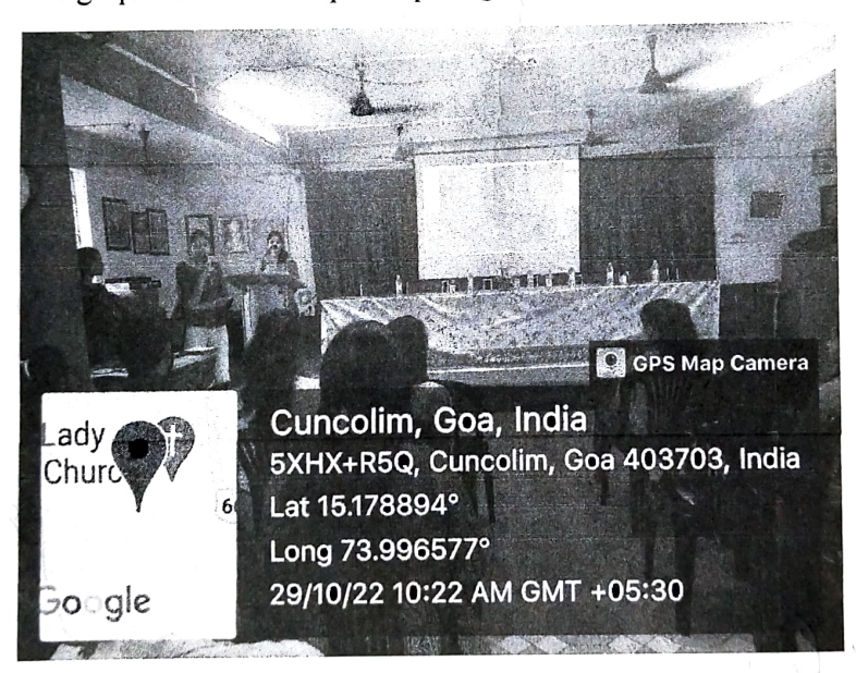
Photograph 2: A student discussing the movie dialogues