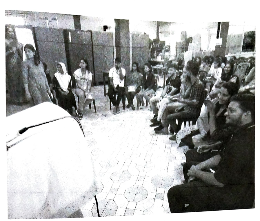
Photograph 5: Students participating in the Quiz