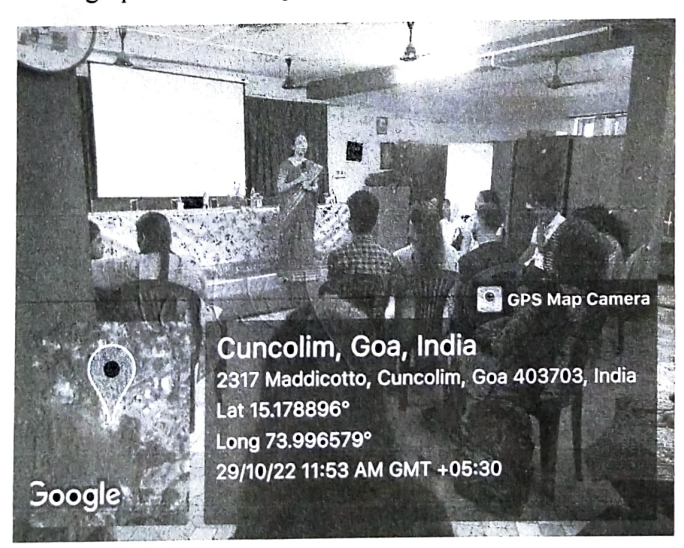
Photograph 4: Programme Director (WS) talking about the MA Women's Studies Programme