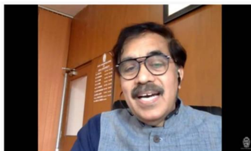
National Webinar On Advances in Plant Science

1,489 views · Streamed live on Feb 3, 2022