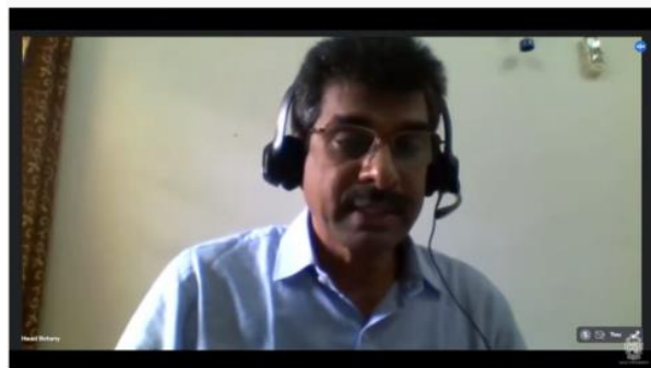
National Webinar On Advances in Plant Science - DAY 2