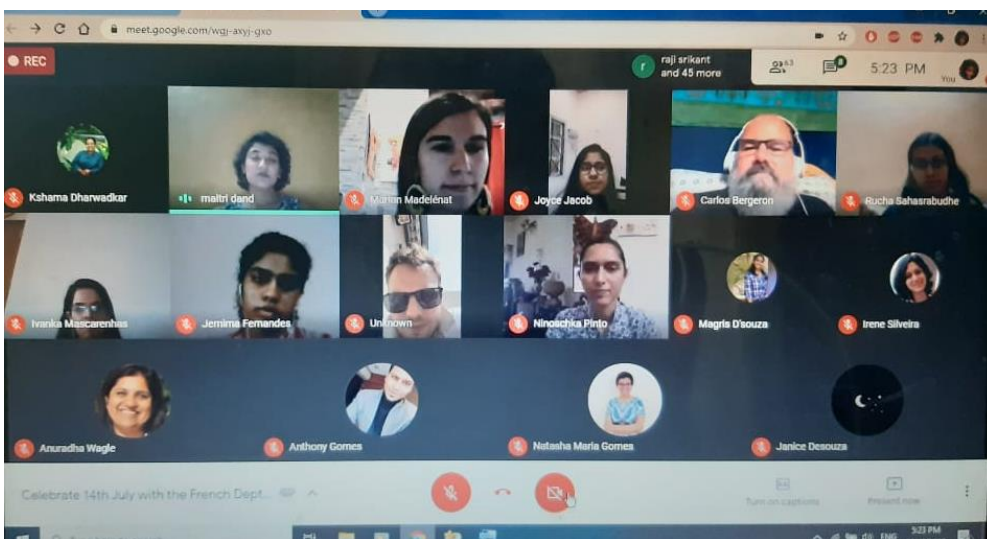
Screen shot of the virtual celebrations conducted via Google Meet