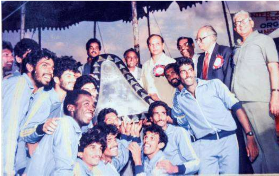
WINNERS TAKE IT ALL: Goa University players cannot hide their joy as they receive the winners' trophy at the hands of the then chief minister, Pratapsingh Rane