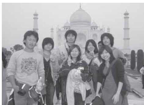
SIP students on a visit to the Taj Mahal

The exchange programme included the study of Indian Culture through Language & Literature, Indian History, Indian Philosophy, Indian Economic Development, Indian Politics & Foreign Policy and Social Issues in India, interspersed with two study tours, one to South India and one to the North. The Programme also included non-credit courses in Indian music, dance and Yoga, and visit to NGOs.