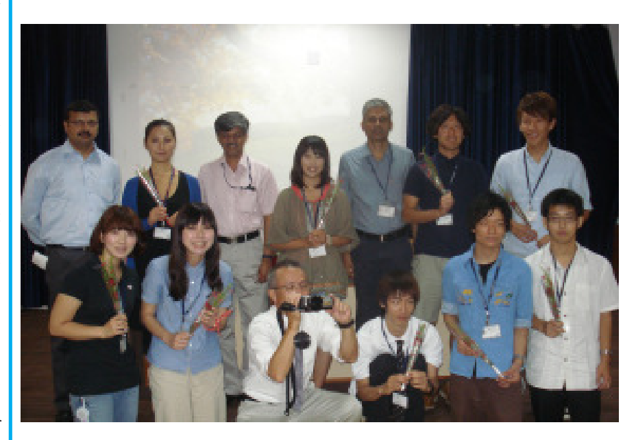
Students of College of International Relations, Nihon University, with SIP coordinators

The 7<sup>th</sup> Edition of the Study India Program (SIP 2010-11) for students of Centre for International Relations, Nihon University, Japan, began with a colourful inaugural ceremony on 20<sup>th</sup> September.