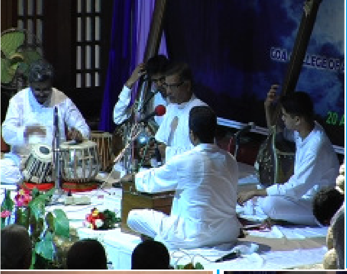
GU foyer comes alive at Malhar Darshan